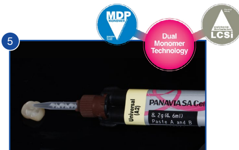
Inject Cement Directly Into Any Glass Ceramic, Metal, Zirconia or Composite Restoration