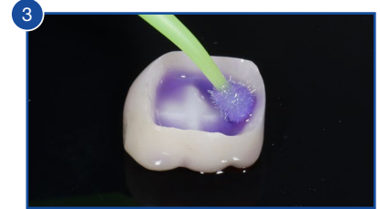
Rub 10 Seconds, Rinse & Dry