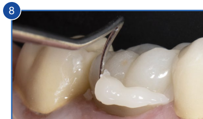
Curing Chemistry Provides Nice Gel-State For Easy Removal