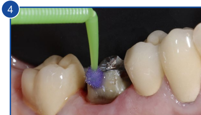
Rub 10 Seconds Rinse & Dry