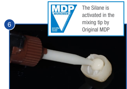
Fresh Activated Silane With Every Mix