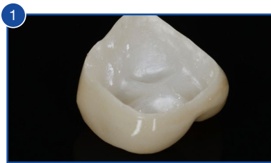
HF Etch & Try-In Complete