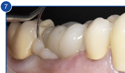
Tack-Cure 2-5 Seconds